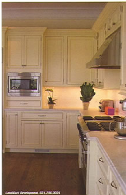
LandMark Development, 631.256.0034

Renovating or designing a kitchen or bath is far from an impossible task. For those blessed with imagination, this is your chance to really show your talents. For the rest of us, there are thankfully some very talented folks only too happy to help you design the kitchen or bath of your dreams. ■