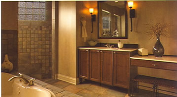
Spirit of France, Southampton 631.287.9800